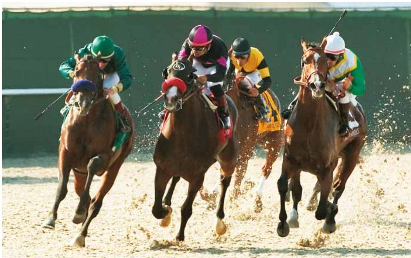
Favored Lava Man (black and pink silks) put in his customary run to the lead as the field hits the top of the stretch