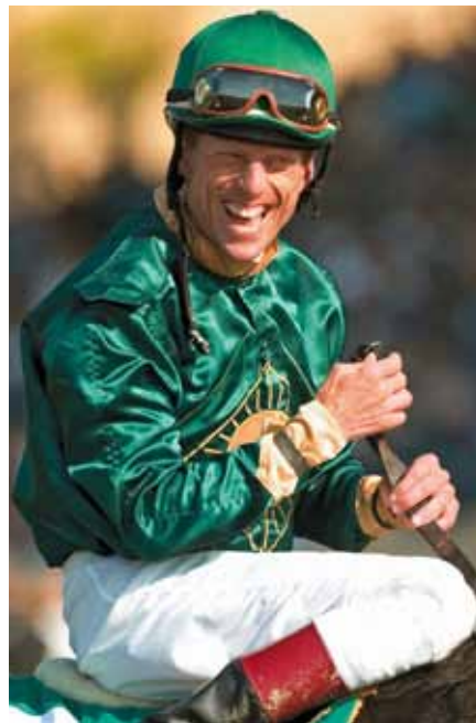
Winning rider Richard Migliore