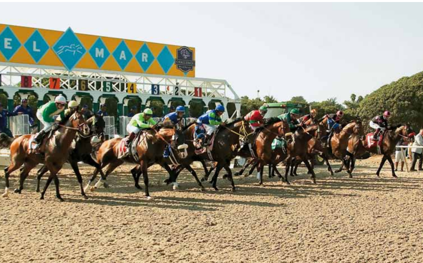
The 12-horse cast for the first Pacific Classic on Polytrack was the second-largest field in the race's history